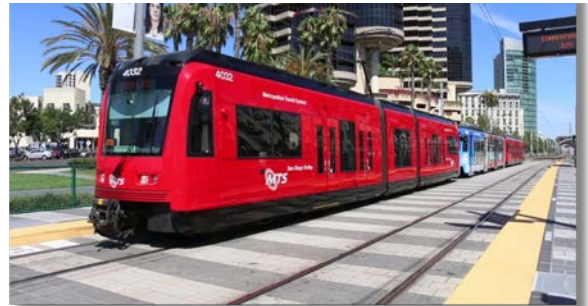
Trolley Lightrail System