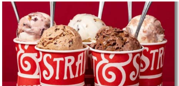
Salt & Straw Ice Cream