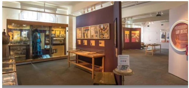
Women's Museum of California