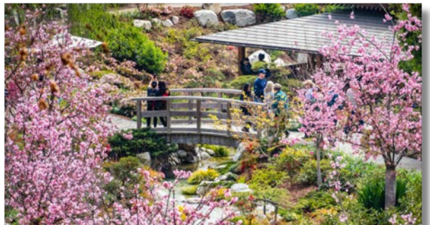
Japanese Friendship Garden & Museum