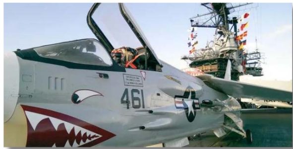
USS Midway Museum