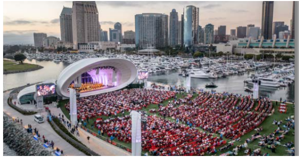
Rady Shell at Jacob's Park