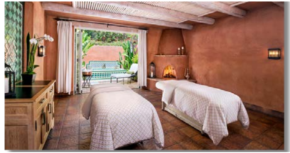
The Spa at Rancho Valencia