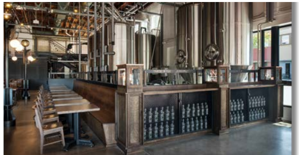
North Park Brewing