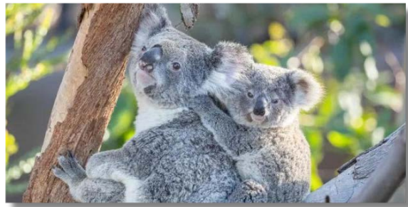
San Diego Zoo